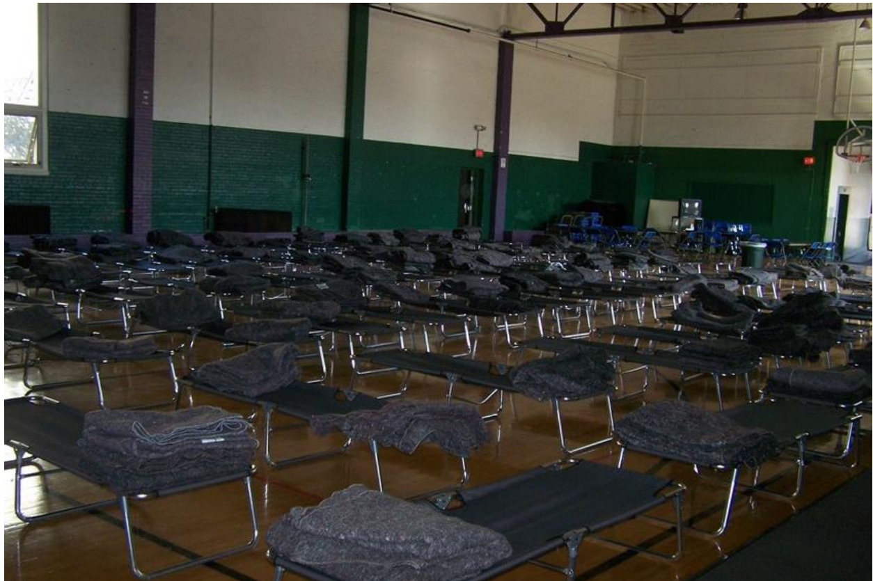
the Sleeping Hall