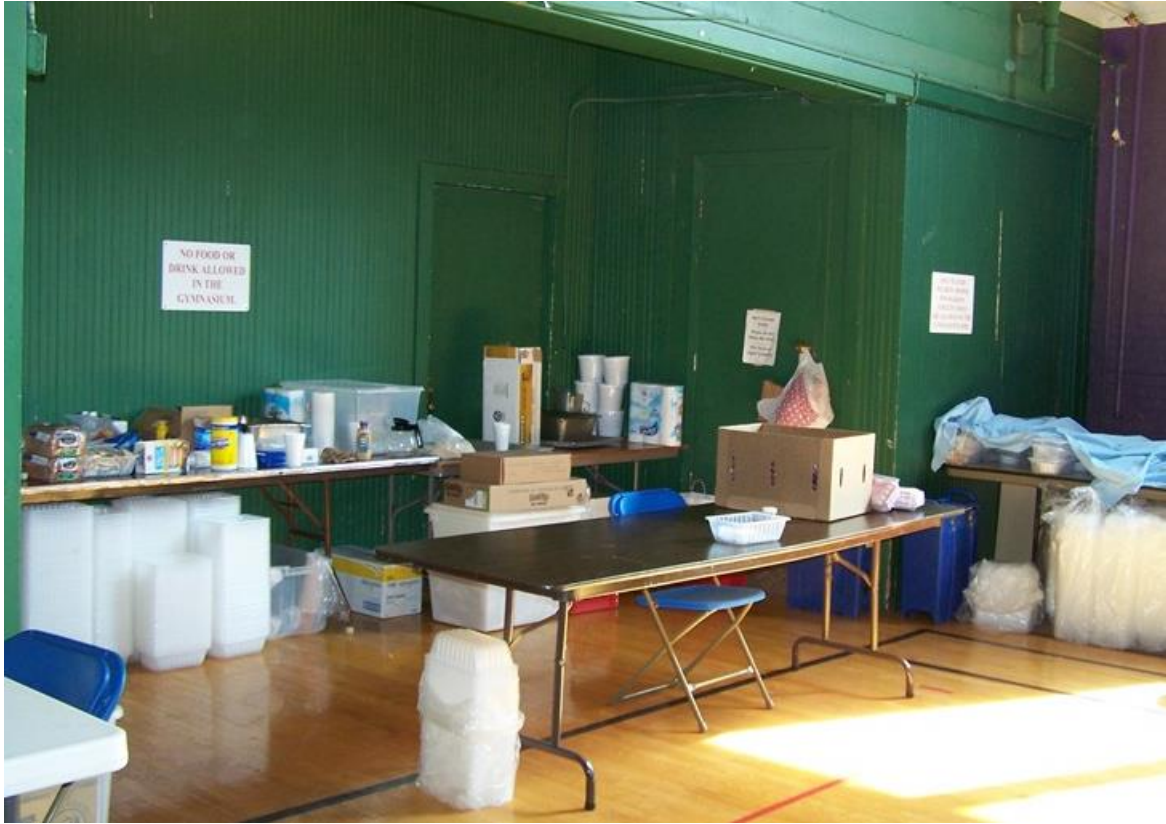
Provisions for a basic evening meal - essentially sandwiches and snacks